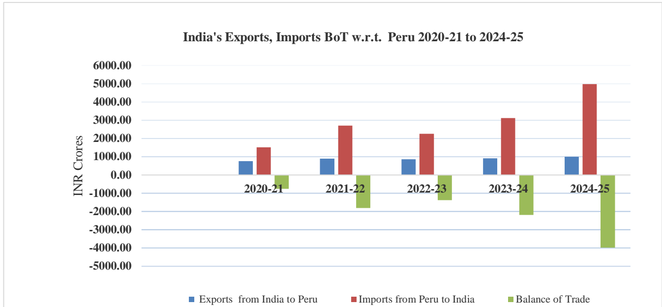
Figure – 2

10. Additionally, from Tables 4 & 5 presented at Annexure-II below the following are stated: