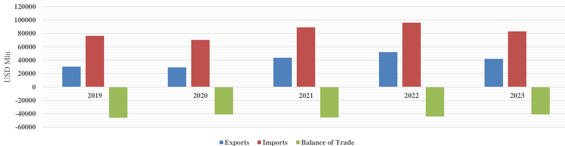
Egypt's Exports, Imports and BoT 2019-2023