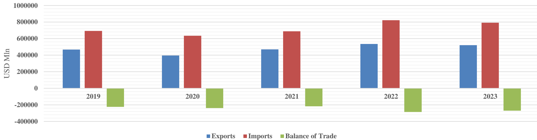
U.K.'s Exports, Imports and BoT 2019-2023